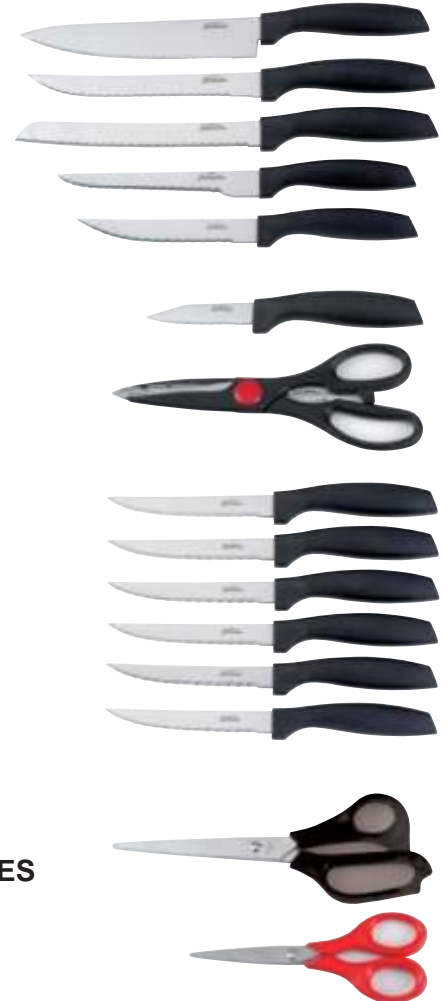
2 Bonus Sissors