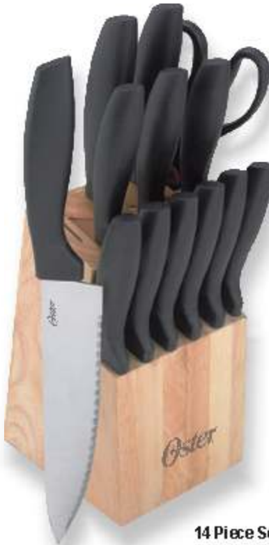
14 Piece Set T-26334