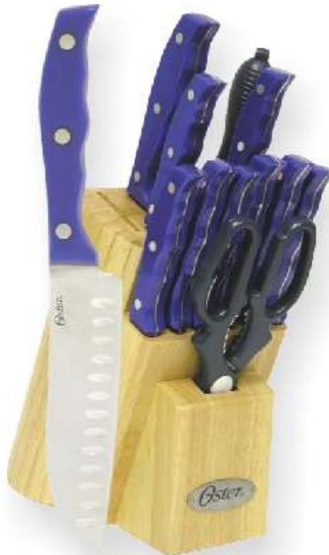
14 Pc Set