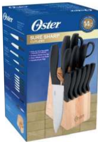
4 Color Packaging