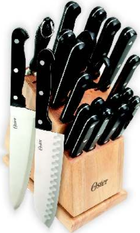
4 Color Packaging